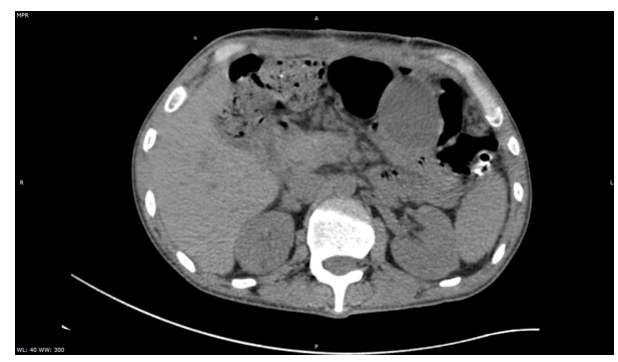
Fig. 3. 5 cm round lesion, bordering the abdominal wall and maintaining a rather inhomogeneous appearance, with moderate delimited margins