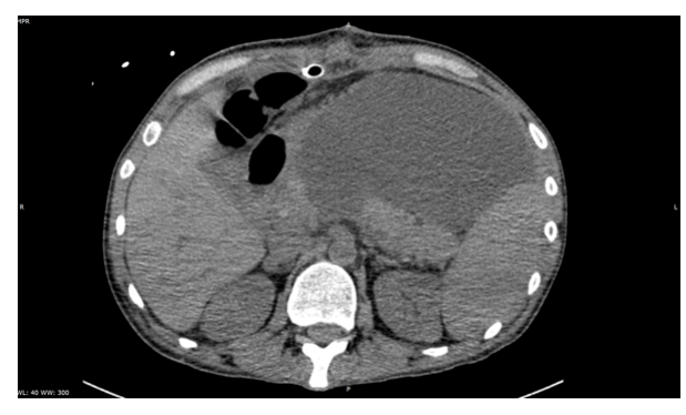
Fig. 2. Mildly enlarged pancreas, moderately edematous and a focal hiperdense lesion in the pancreatic head, presumably hemorrhagic with a large fluid collection (~14/8 cm), reasonably well delimited, with hyperdense margins, dislodging the stomach upwards (pseudocyst)

pancreatitis was done. The computer tomography fig. 1) revealed peripancreatic and mesenteric abdominal fat with edematous infiltration, fluid collections around the liver and in both paracolic gutters. The CT image is suggestive of acute pancreatitis (Balthasar C). He was treated with intravenous hydration (Glucose 10%, NaCl 9%), antibiotics (Ampicillin 500 mg every 6 h), renal drugs support (Furosemide 20 mg injectable solution two times per day), immunosuppressive drugs (Cellcept 5 mg/day and Prograf 1.5 g/day ) and antalgic treatment with Tramadol 25 mg/ day and Metamizol sodic 1 g/2 mL/ day. The patient's status was not improved and after three days he develop surgical acute abdomen. The CT-exam (fig. 2) showed a mildly enlarged pancreas, still moderately edematous and a focal hyperdense lesion in the pancreatic head, presumably hemorrhagic with a large fluid collection (~14/ 8 cm), reasonably well delimited, with hyperdense margins, dislodging the stomach upwards (pseudocyst). The laboratory investigations revealed serum levels of amylases 1122 U/L, glycemia 94 mg/dL, Leukocytes 10.75